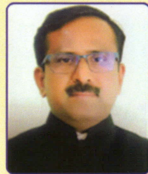
Resource Person Sri G. Naryanaswamy, IRS Commissioner of Central Tax Govt. of India, Bangaluru