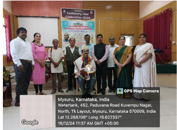
Felicitating Vice Chancellor