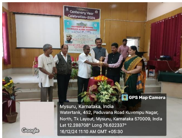
Dignitaries lighting the Lamp