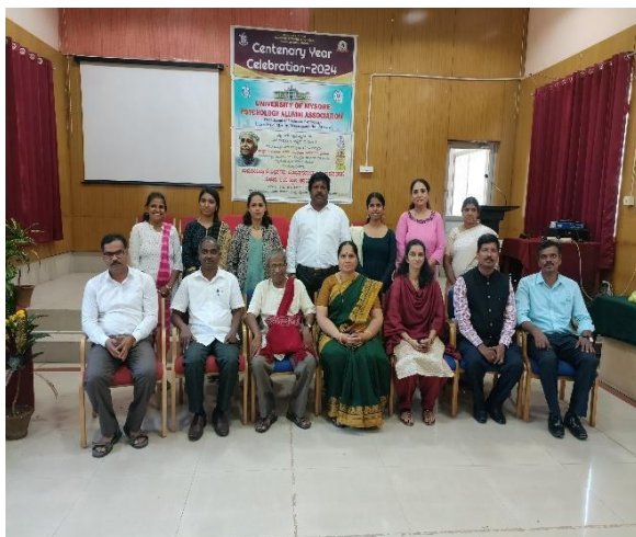
Group Photo with Staff members

The first session “Concentration – challenges today” was motivational and the second session “Kuvempu and psychology” was thought-provoking. Both the speakers had their unique way of rendering the lecture which made every listener to takeaway something from the session which clearly made some impact on their affect and behaviour. The lecture concluded with the felicitation of the esteemed resource people, acknowledging their invaluable contribution. This was followed by a vote of thanks, expressing gratitude to all organizers, guests and participants. The lecture was formally concluded with a group photo session, followed by lunch. The program marked a great success with over more than one hundred and sixty participants, comprising of senior lectures, students, staff, research scholars from the DOS in Psychology and its constituent colleges across Mysore. The Program received extensive coverage from the print media, with several prominent publications carrying reports and features.