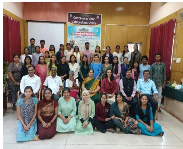
Group Photo with Participants