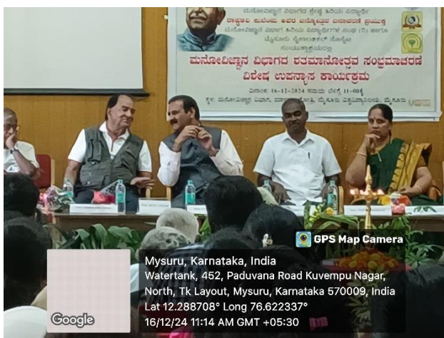
Dignitaries in conversation