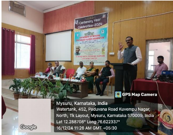
Vice Chancellor delivering Inaugural Speech