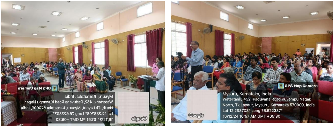
Section of the Audience