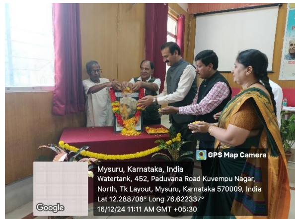
Dignitaries offering floral tribute to Kuvempu