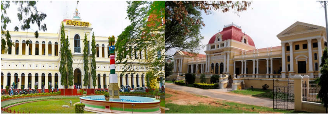
Maharaja's College (1889)