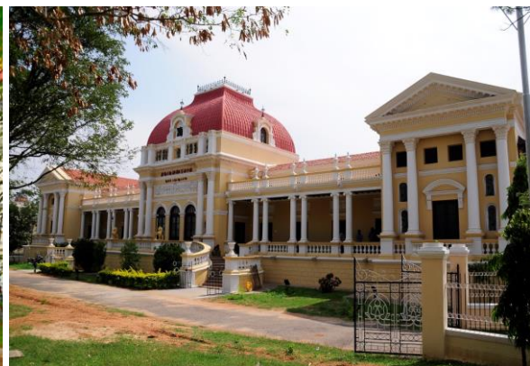
Oriental Research Institute (1891)