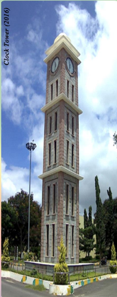
Clock Tower (2016)