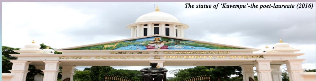
The statue of 'Kuvempu'-the poet-laureate (2016)