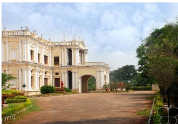
Jayalakshmi Vilas Mansion (1905)