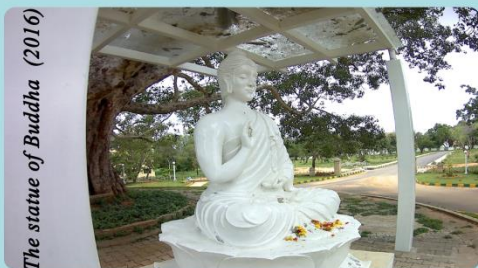
The statue of Buddha (2016)