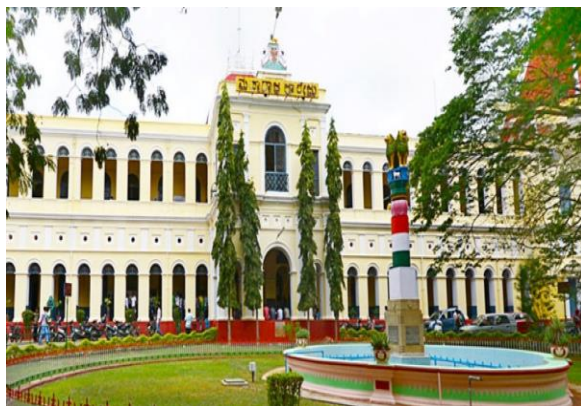
Maharaja's College (1889)