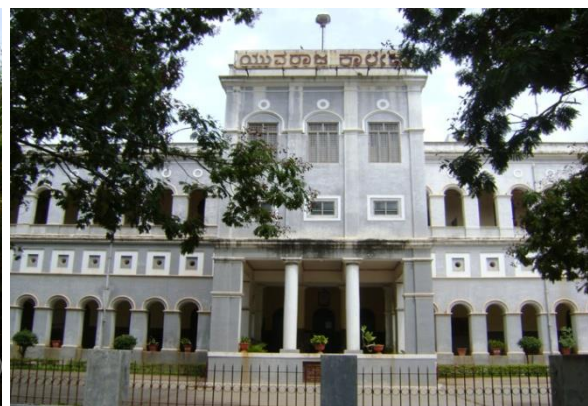
Yuvaraja's College (1927)