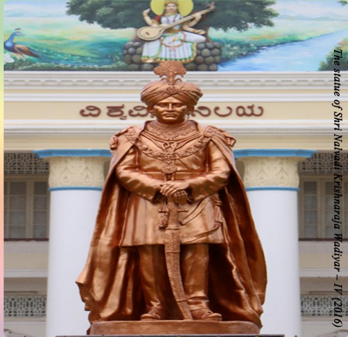
The statue of Shri Nalvadi Krishnaraja Wadiyar - IV (2016)