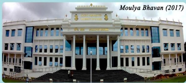
Moulya Bhavan (2017)