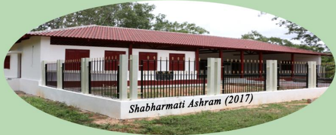
Shabharmati Ashram (2017)