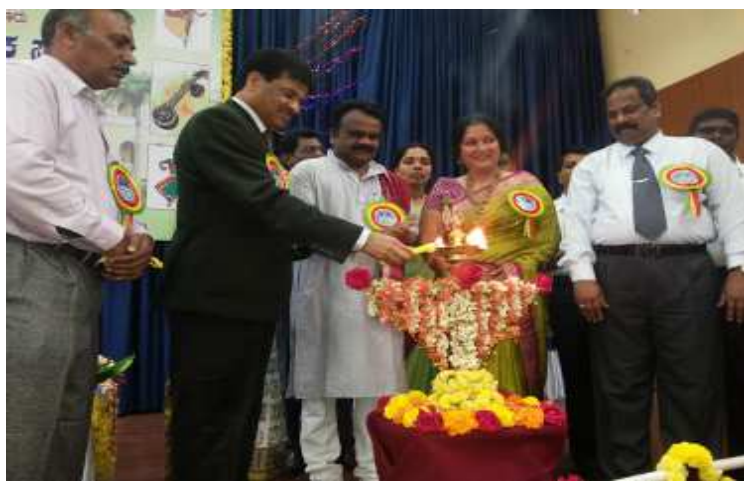
Inauguration of the literary competitions