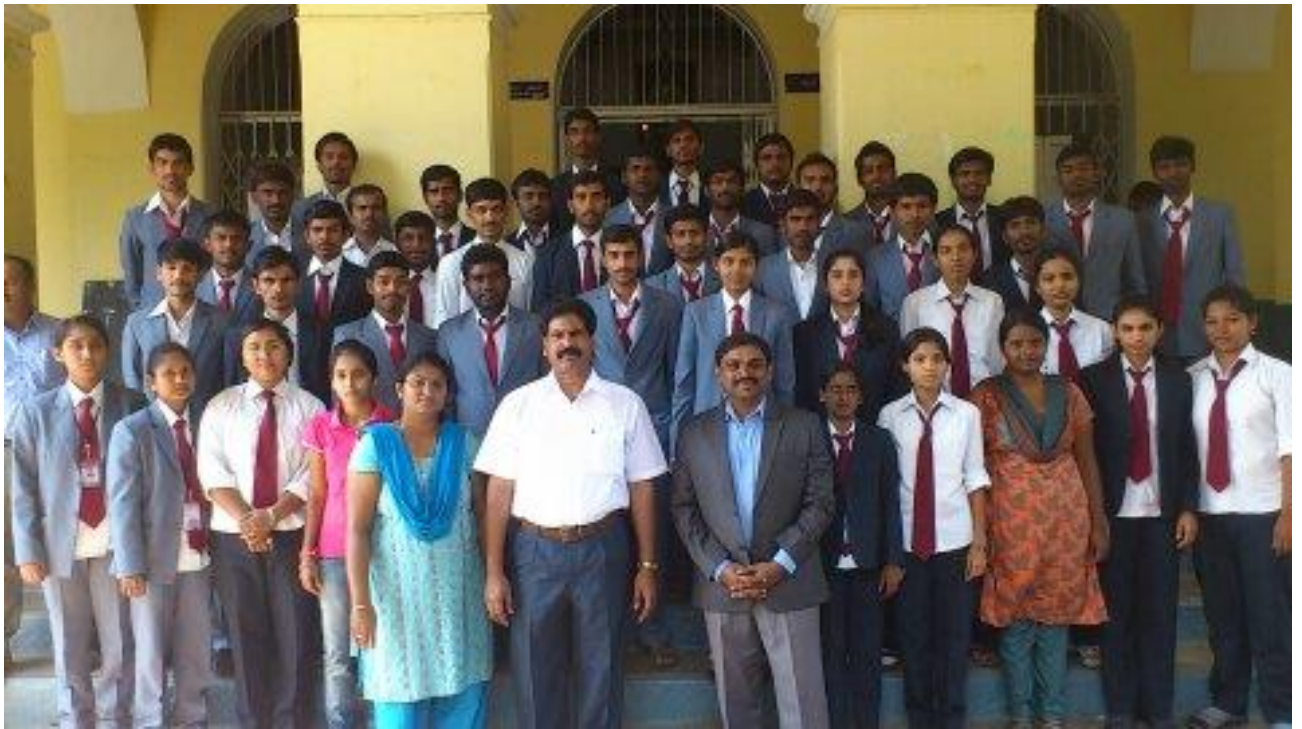
Image: MoU Signing with InfoMaps Pvt. Ltd., Chennai Maps (Nokia) Pvt. Ltd., Bangalore