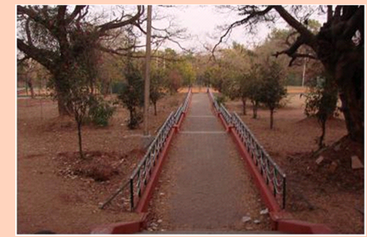
MAHARAJA'S COLLEGE PARK