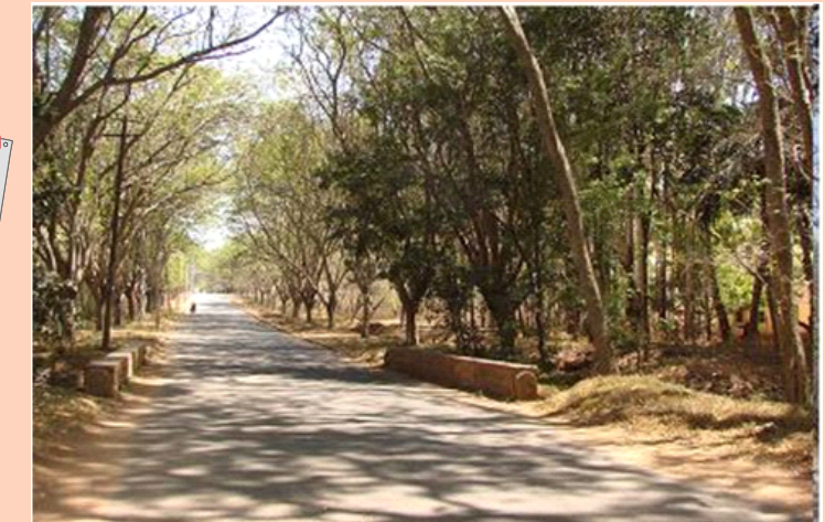
J.C.E. UTILITY POINT ROAD