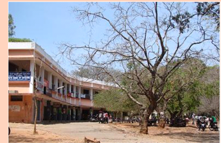
DOWN'S MULTI UTILITY POINT