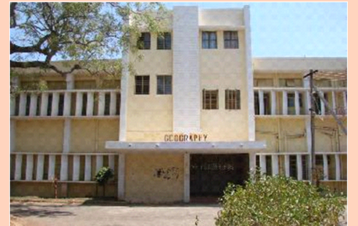
DEPT. OF GEOGRAPHY