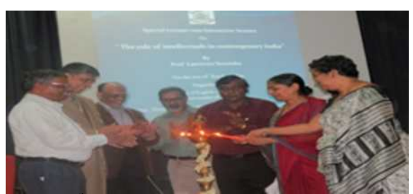
On 7<sup>th</sup> July, 2012: 390 graduates out of 725 were shortlisted for final round leading to placements

Online Campus Connect Profiling / Question Bank Browsing programmes for varied competences: