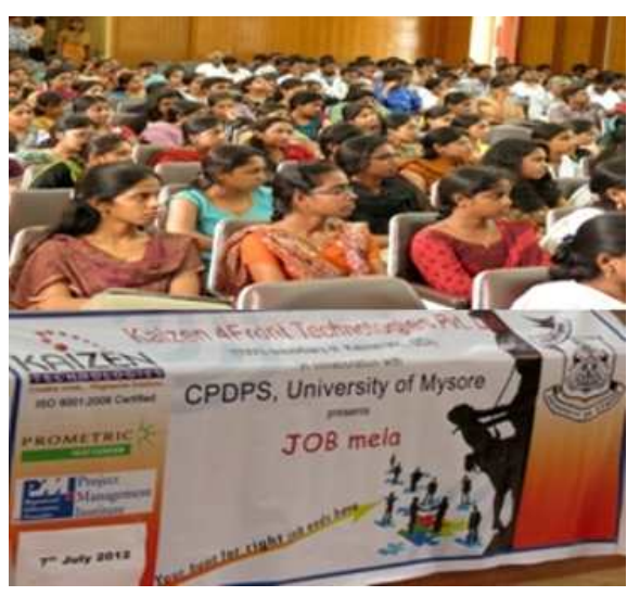
MOU signed with 'Campus Connect' for online profiling

Online Campus Connect Profiling / Question Bank Browsing programmes for varied competences: