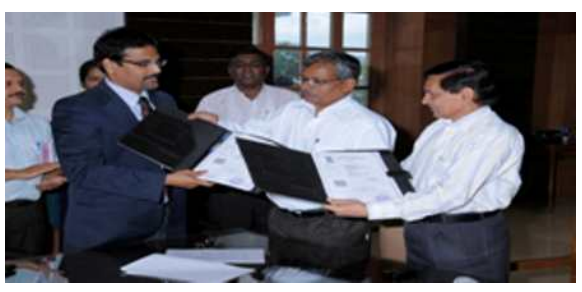
MOU signed with 'Kaizen 4Front Technologies Pvt. Ltd'