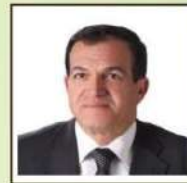
CONFERENCE CO-CHAIR KEYNOTE SPEAKER