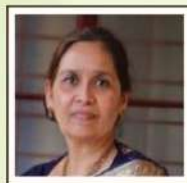
CONFERENCE CO-CHAIR KEYNOTE SPEAKER

DBT-Distinguished Biotechnology Research Professor University of Calcutta, India